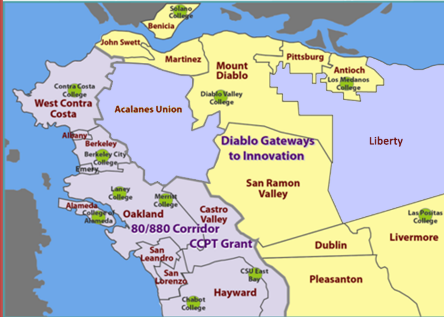
I-80 Corridor (Blue) and I-680 (Yellow) Consortium Service Areas with Distribution of Member Districts and Colleges